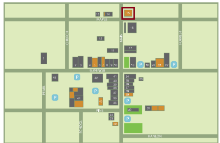
Building 15 Downtown Wayland Map