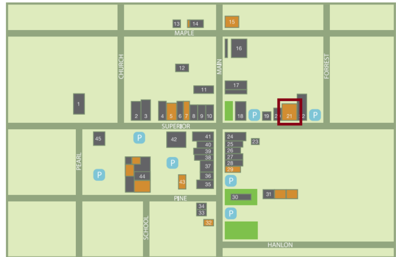
Building 21 Downtown Wayland Map