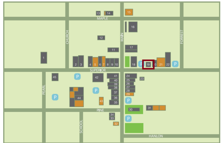
Building 19 Downtown Wayland Map